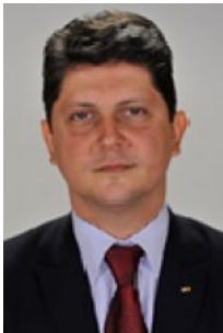
Mr Titus CORLATEAN

Chair, Joint Committee of Chamber of Deputies and Senate for Romania's accession to the Schengen area National Social Party - S&D