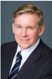
Mr Audronius AŽUBALIS

Vice-Chair, Foreign Affairs Committee Homeland Union - Lithuanian Christian Democrats - EPP