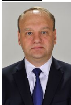
Mr Ovidiu-Liviu DON U

Chair, Committee on constitutional affairs, civil liberties and monitoring the implementation of the decisions issued by the European Court of Human Rights PSD -S&D