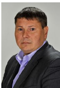
Mr Marian PAVEL

Chair, Committee on constitutional affairs, civil liberties and monitoring the implementation of the decisions issued by the European Court of Human Rights PSD -S&D