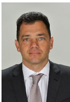
Mr tefan-Radu OPREA

Committee on constitutional affairs, civil liberties and monitoring the implementation of the decisions issued by the European Court of Human Rights PSD - S&D