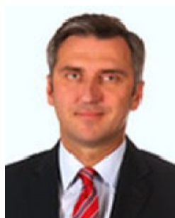
Mr Waldemar SŁUGOCKI

Vice-Chair, Foreign and European Union Affairs Committee