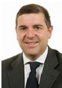
Mr Albéric DE MONTGOLFIER

Rapporteur général, Finances Committee Les républicains / EPP