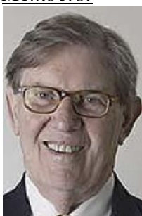
Sir William CASH

Chair, European Scrutiny Committee Conservatives / ECR