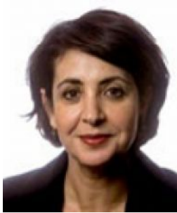
Ms Khadija ARIB

Speaker of the House of Representatives PvdA / S&D