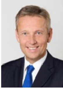
Mr Reinhold LOPATKA

Foreign Affairs Committee Austrian People's Party / EPP