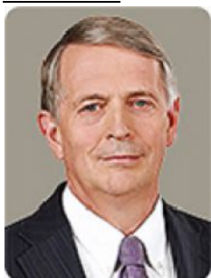
Mr Inesis BO IS

Economic, Agricultural, Environmental and Regional Policy Committee Unity Party / EPP