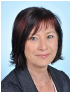
Ms Danielle AUROI

Chair, European Affairs Committee Écologiste / Greens/EFA