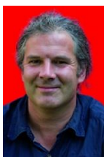
Mr Andrej HUNKO

European Affairs Committee Die Linke / GUE/NGL