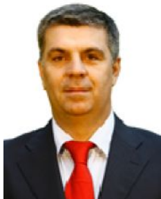
Mr Valeriu tefan ZGONEA

President of the Chamber of Deputies European Affairs Committee Social Democratic Party / S&D