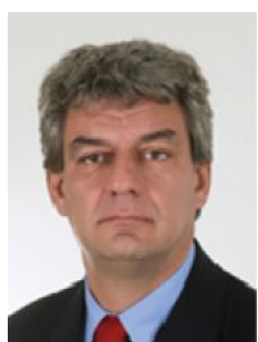
Mr Mihai TUDOSE

Chair, Committee on Labour and Social Protection Social Democratic Party / S&D