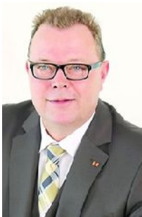
Mr Michael STÜBGEN