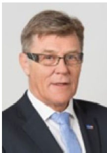
Mr Bernhard THEMESSEL

Foreign Affairs Committee The Greens / Greens/EFA