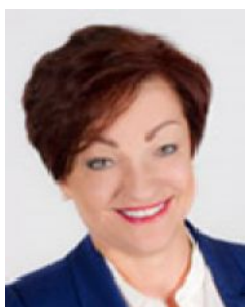
Ms Mirosława NYKIEL

Vice-Chair, European Union Affairs Committee Law and Justice Party / ECR