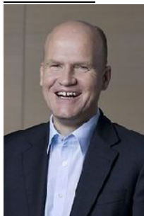
Mr Ralph BRINKHAUS