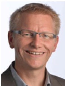
Mr Georges GILKINET

Finance Committee Ecolo Groen / Greens/EFA