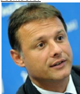
Mr Gordan JANDROKOVI

Chair, European Affairs Committee Croatian Democratic Union / EPP