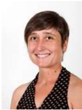
Ms Marta SIBINA

Popular Party - EPP (European People's Party (Christian Democrats))