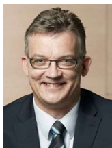
Mr Uwe FEILER Finance Committee CDU - EPP (European People's Party (Christian Democrats))