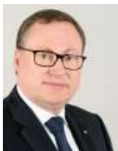
Mr Grzegorz BIERECKI Chair, Budget and Public Finance Committee Law and Justice - ECR (European Conservatives and Reformists)