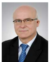
Mr Mieczysław AUGUSTYN Family, Senior and Social Policy Committee Civic Platform - EPP (European People's Party (Christian Democrats))