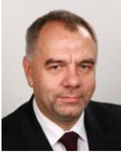
Mr Jacek SASIN

Chair, Public Finance Committee Law and Justice - ECR