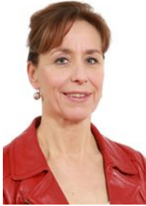
Ms Fabienne KELLER Vice-Chair, Finance Committee Vice-Chair, European Affairs Committee Les Républicains - EPP