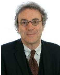
Mr Paolo GUERRIERI PALEOTTI EU policies Committee Partito Democratico - S&D