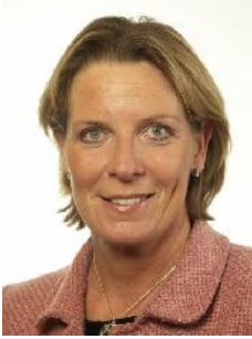
Ms Helena BOUVENG Committee on Taxation The Moderate Party - EPP