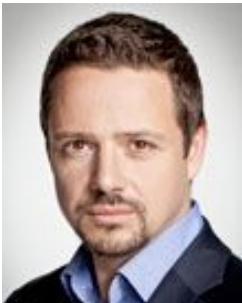
Mr Rafał TRZASKOWSKI

Vice-Chair, European Affairs Committee Law and Justice - ECR