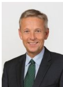
Mr Reinhold LOPATKA Main Committee Austrian People's Party - EPP