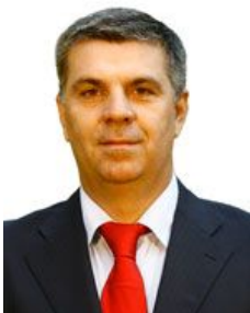
Mr Valeriu Ștefan ZGONEA Committee for Human Rights, Culture and National Minorities Issues Independent - Non-attached