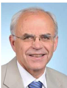
Mr Marc LAFFINEUR European Affairs Committee Les Républicains - EPP