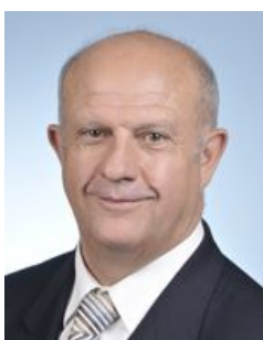
Mr Gilles SAVARY European Affairs Committee Socialiste, écologiste et républicain - S&D