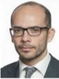
Mr Manuel RODRIGUES European Affairs Committee PSD - EPP