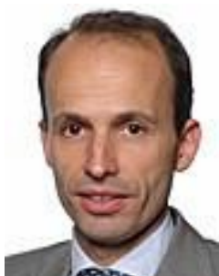
Mr Pedro MOTA SOARES

European Affairs Committee PCP - GUE/NGL