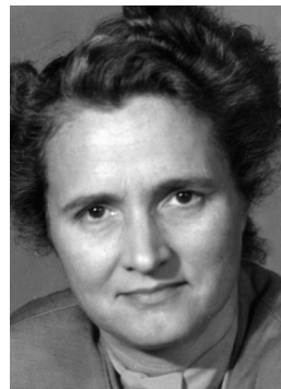
MARGA KLOMPE 2