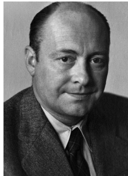
HANS-JOACHIM VON MERKATZ 1