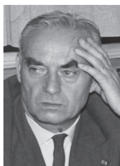
ANDRÉ MUTTER 3