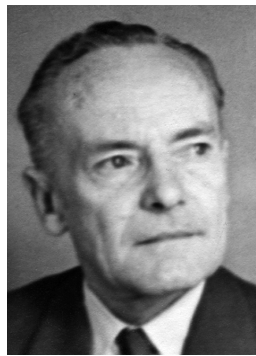
GERHARD KREYSSIG 2