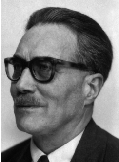
FRANÇOIS DE MENTHON 1