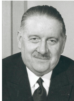
ALAIN POHER 1