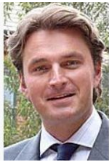
Mr Daniel KAWCZYNSKI

Foreign Affairs Committee Scottish National Party - Greens/EFA