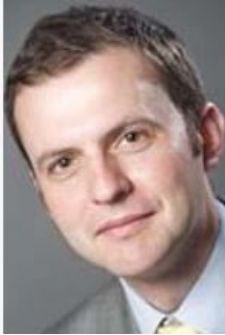
Mr Stephen GETHINS

Foreign Affairs Committee Scottish National Party - Greens/EFA