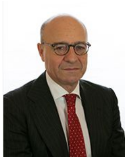
Mr Nicola LATORRE

Chair, Committee on Defence Partito Democratico (PD) - S&D