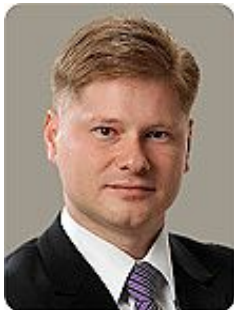
Mr Sergejs POTAPKINS

Vice-Chair, Foreign Affairs Committee National Alliance of All for Latvia! and For Fatherland and Freedom/LNNK - ECR