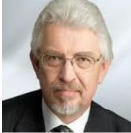
Mr Ojars KALNIŠ

Chair, Foreign Affairs Committee Unity Party - EPP