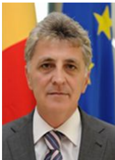
Mr Mircea DU A

Chair, Committee for Defence, Public Order and National Security PSD-Social Democratic Party - S&D