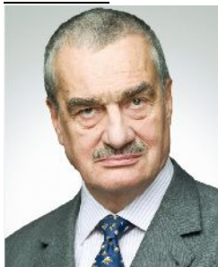
Mr Karel SCHWARZENBERG

Chair, Committee on Foreign Affairs Poslanecký klub TOP 09 a Starostové - EPP