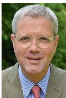
Mr Norbert RÖTTGEN

Chair, Foreign Affairs Committee CDU/CSU - EPP