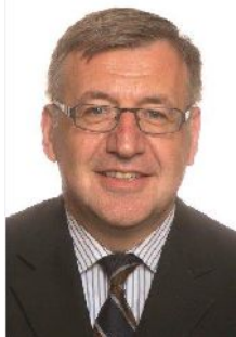
Mr Steven VANACKERE

Chair, International Affairs Committee CD&V - EPP