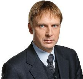
Mr Eerik-Niiles KROSS

Foreign Affairs Committee Estonian Reform Party - ALDE