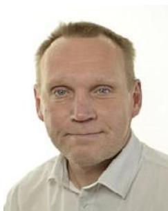
Mr Pyry NIEMI

Committee on Foreign Affairs The Sweden Democrats - EFDD