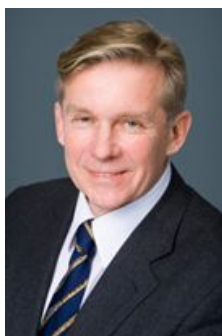
Mr Audronius AŽUBALIS

Chair, Committee on National Security and Defence Labour Party - ALDE