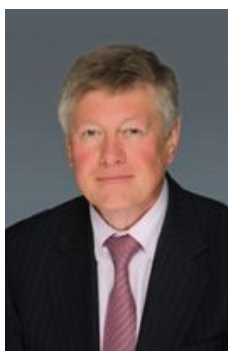
Mr Arturas PAULAUSKAS

Chair, Committee on Foreign Affairs Social Democratic Party - S&D