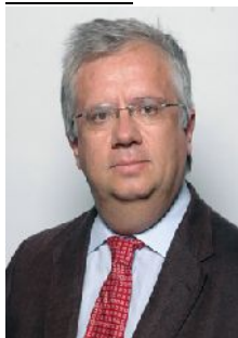
Mr Eduardo CABRITA

Chair, Committee on Budget, Finance and Public Administration PS - S&D