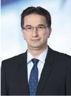
Mr Pál VÖLNER

Vice-Chair, Committee on Economics Fidesz - EPP