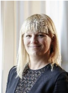
Ms Urška BAN

Chair, Committee on EU Affairs Party of Modern Centre - ALDE