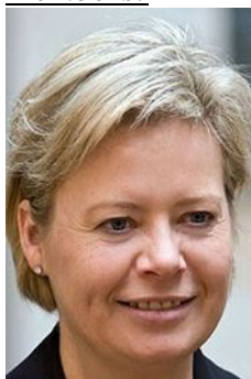
Ms Gesine LÖTZSCH

Chair, Budget Committee Die Linke - GUE/NGL