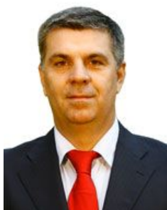
Mr Valeriu tefan ZGONEA

President of the Chamber of Deputies Social Democratic Party (PSD) - S&D