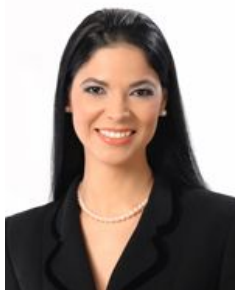
Ms Ana BIRCHALL

President of the Chamber of Deputies Social Democratic Party (PSD) - S&D