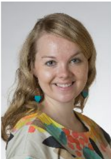
Ms Katri KULMUNI