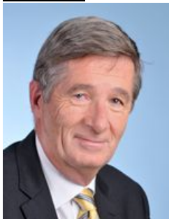
Mr Pierre LEQUILLER

Vice-Président, Commissions des affaires européennes Les Républicains - EPP