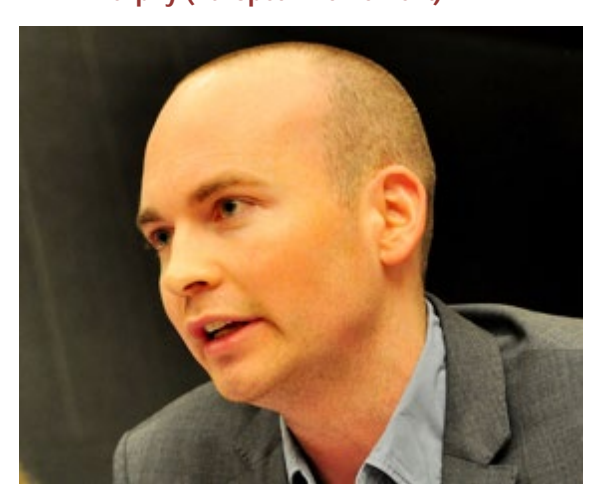
Mr. P. Murphy (European Parliament)

The current crisis is a deep, systemic crisis of capitalism reflected in the collapse of investment throughout the advanced capitalist world. In Europe, the rhetoric is that, in order to exit the crisis, each country should seek to have a balance of trade surplus. However, countries cannot export their way out of the crisis. What is required is a policy that will deliver growth and offer an alternative to the disastrous austerity policies, as well as massive public investment if the private sector is unwilling to invest. If trade is to play a role and be a tool of economic growth, job creation and poverty alleviation, there has to be a fundamental change in how it is carried out. Trade has to be built on solidarity and development, and should not be used as a tool to enable big businesses in the richer countries to access resources and markets in the lesser developed countries.