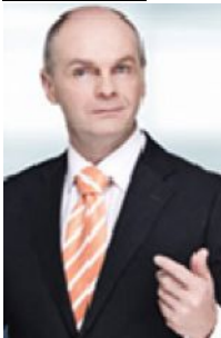
Mr Arminas LYDEKA

Committee on Foreign Affairs Liberals Movement of the Republic of Lithuania - ALDE