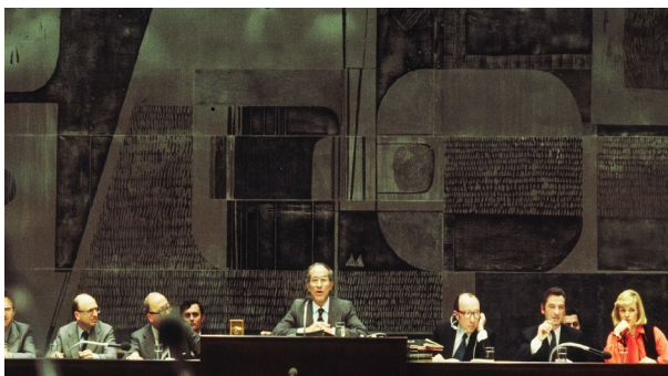
Emilio Colombo, President of the European Parliament addresses a plenary session in Luxembourg in 1979.

The Luxembourg hemicycle is noted for the artistic value of its decor, in particular the zinc bas-relief created by the Turin-based NP2 Group. Thanks to interviews with the artists, this briefing provides details of the artwork, including the story of how the Italian company came to be commissioned by the Belgian contractor fitting out the chamber.