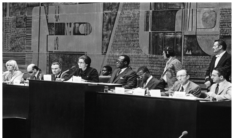
Simone Veil, EP President during the African Caribbean and Pacific group of states' dialogue with Europe – 1979 in Luxembourg.