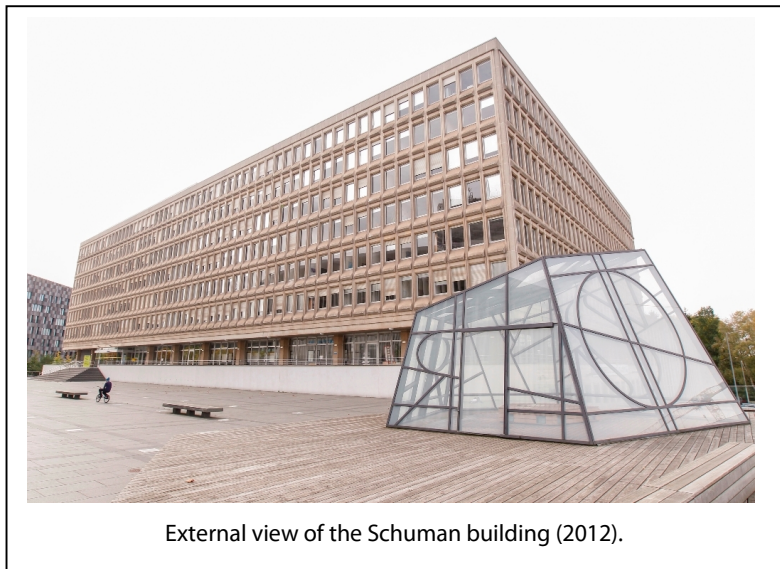
External view of the Schuman building (2012).