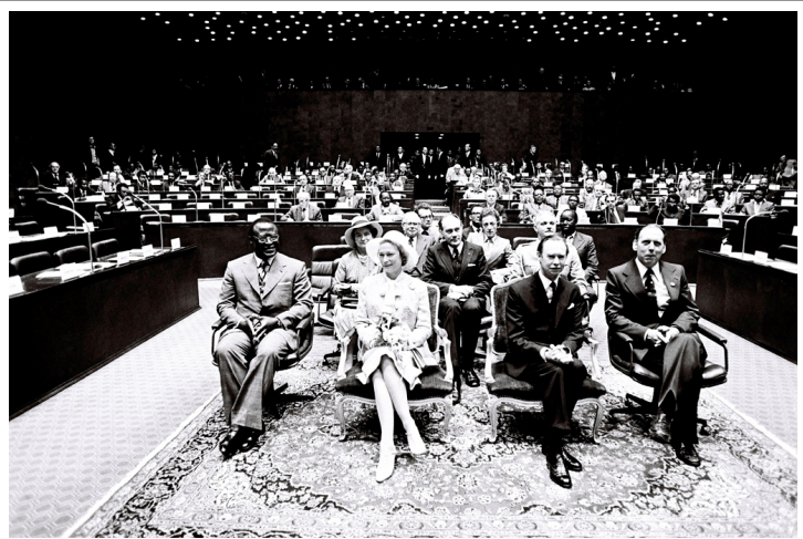
Meeting of the ACP-EEC Consultative Assembly in Luxembourg, 1976: Jean, the Grand Duke of Luxembourg, and Joséphine-Charlotte, the Grand Duchess.

The first part-session in the new hemicycle was held on 12 February 1973; on that occasion, the then President of the Commission, François-Xavier Ortoli, presented the Commission's sixth annual programme, for 1973. Between 1973 and 1979 the hemicycle hosted 35 meetings of the European Parliament, chaired by four different presidents. During this time the plenary part-sessions of the EP were held alternatively in Luxembourg and Strasbourg, with almost half of them being organised in Luxembourg. The annual calendar was adopted by the enlarged Bureau.