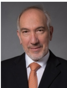
Mr Marcel OBERWEIS

Vice-President of the Luxembourg Chamber of Deputies, Chair of the Committee on Environment and Chair of the Sub-Committee on Climate and Energy Déi Gréng - Greens/EFA