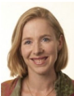
Ms Stientje VAN VELDHOVEN

Infrastructure and Environment Committee Partij van de Arbeid (PvdA) - S&D