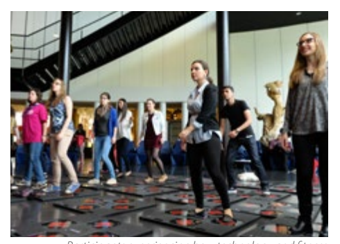
Participants experiencing how technology and fitness can go along with the iDance Machine

As with many other functions of public institutions, education is increasingly being