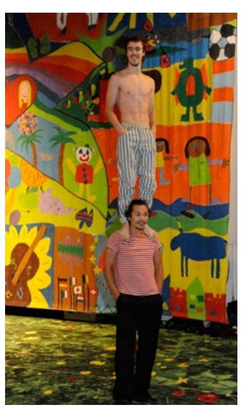
Two young artists performing in the circus show

"All of the problems we have with discrimination, I think we can solve by educating people; it's all about not having enough knowledge. We have to educate people so that they understand what an immigrant actually does, so that people don't buy into the propaganda - that immigration is all about us gaining or losing money - because it's about so much more. Immigration is also about gaining or losing culture - mainly gaining".