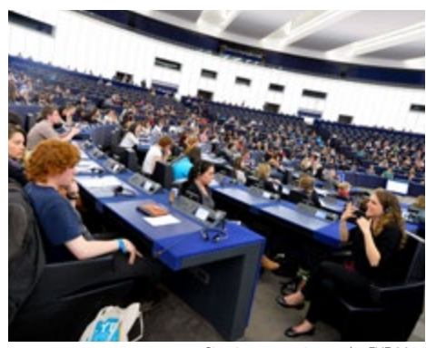
Sign interpretation at the EYE 2014

With the YO!Fest public concerts in the City of Strasbourg and Wacken, the EYE reached well beyond the 5,500 participants, enticing an additional 4,500 people to the European Parliament and the Youth Forum. The concerts provided a hook to reach out to local people in Strasbourg and the less engaged young people, and motivating a significant number to participate in other YO!Fest activities.