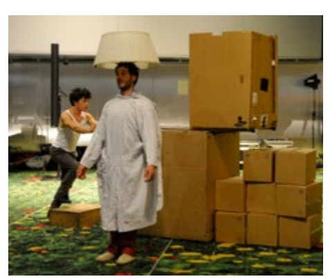
Another glimpse of the circus show in the flower bar

In a panel discussion on the future of sustainable fishing, participants noted the recent achievements of the EU with regard to legislative changes, but also the great challenges involved in implementation and achieving a common EU policy, in spite of the fact that some countries are much more affected than others. The participants criticised the strong lobbying which recently led to the rejection of a phase-out of destructive deep-sea bottom trawling by a thin majority in the Parliament, and it was felt that the issue should be put on the agenda again. Moreover, many participants, in particular those of southern European origin, called for more incentives and support for fishermen in their countries, in order to, for example, earn a living with fishing tourism. They felt that the quotas and excessive EU regulation negatively affect their communities. Panellists and participants alike suggested greater flexibility with regard to quotas so that less fish is thrown back into the sea, and for incentives for a diversification of the European diet towards other fish species.