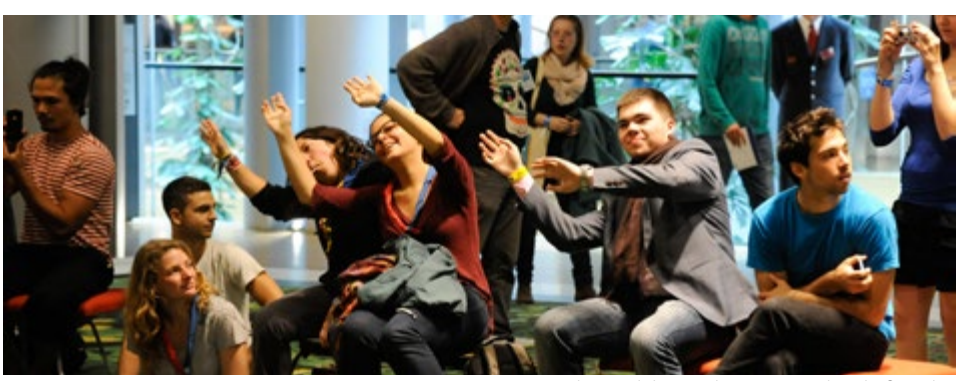
Participants watching and cheering during a spectacle in the flower bar

"Nobody knows what Europe is - it's messy, but it's nice!"