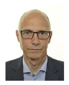
Mr Rikard LARSSON

Committee on Transport and Communications The Moderate Party - EPP