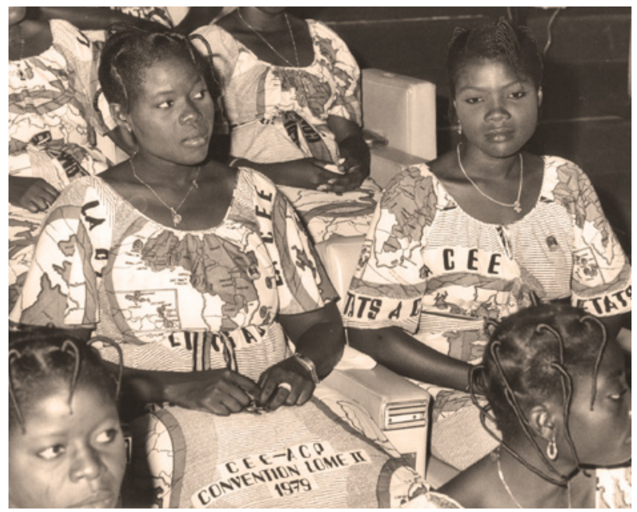
Togolese attendants wearing skirts bearing the text 'CEE-ACP convention de Lomé II, 1979'

On 4 November 1980 the agreement for the accession of Zimbabwe was signed<sup>174</sup> with a transitional system pending ratifications. The agreement extended the Convention to cover the new acceding state, increasing the Development Fund by 85 million units of account, and contained certain specific provisions on beef and veal, sugar and tobacco, to take into account the country's specific products and the impact that their export to the Community under the terms and conditions laid down by the Lomé Convention would have<sup>175</sup>. The European Parliament, expressing its opinion in favour, hoped soon to see