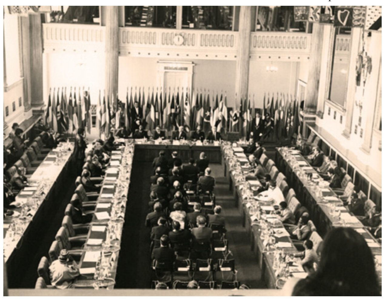
Dublin, meeting of the ACP-EEC Joint Committee, May 1975

The Stabex Fund was allocated 375 million units of account (UA) divided into equal instalments for each of the five years for which the Convention was in force, while the ESF was allocated, for the same period, 3.15 billion UA, and in addition the EIB was allocated 400 million UA in loans. This totalled 3.55 billion UA of financial aid, of which 3.39 billion UA was for the ACP States and 160 million UA for the OCTs and overseas departments.