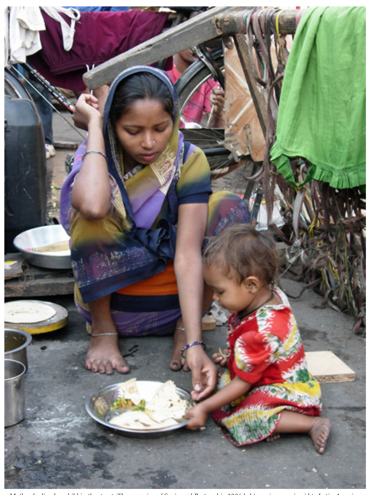
Mother feeding her child in the street. The accession of Spain and Portugal in 1986 led to an increase in aid to Latin America, with a corresponding decline in aid for Asia.