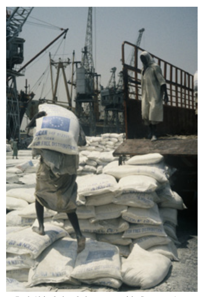
Food aid for Sudan. Sudan was one of the first countries to receive food aid in the 1970s.

The least developed countries were another special case and the Commission proposed a specific regulation on exceptional food aid for them. Parliament welcomed this initiative<sup>462</sup>, but warned that this exceptional aid should not lead to a reduction in ordinary aid. There was also an institutional question: the