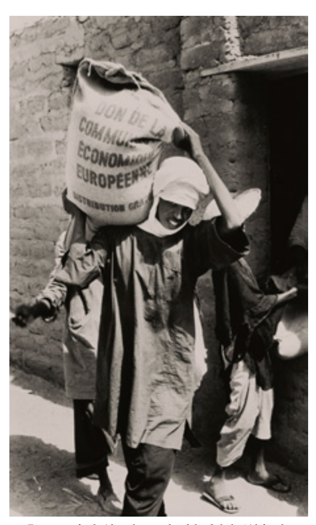
European food aid to the people of the Sahel. Aid for the victims of the Sahel drought was the first project in a developing country financed by the Communities.