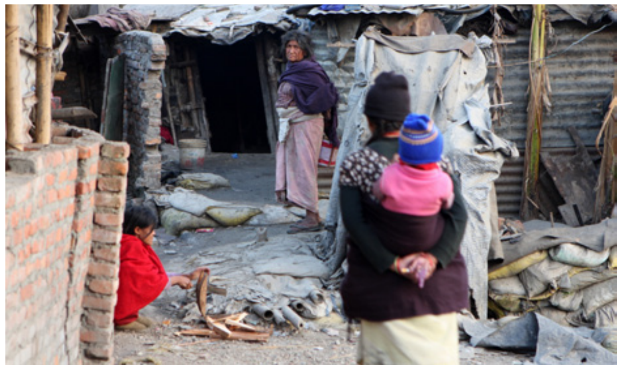
A poor housing area in Old Baneshwor near Bagmati in Kathmandu, Nepal. Because of Nepal's poverty, the European Parliament decided in 1996 to grant it 'privileged country' status in trade relations.

Cambodia was dependent on international aid for 48% of its budget and was seeking to encourage foreign investment, although investors were deterred by its turbulent domestic situation. This too was one of the objectives of the Agreement with the European Union, primarily geared to combating poverty, lasting development and social progress. As concerns human rights and the establishment of an effective democratic system, the Agreement with Cambodia provided for broadly similar mechanisms to those in the Agreement with Laos.