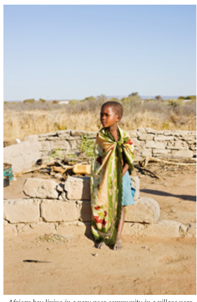
African boy living in a very poor community in a village near the Kalahari Desert, Namibia. In the early 1990s Namibia became independent and joined the Southern African Development Community (SADC).

After this resolution, the European Parliament delivered further opinions on the South Africa situation in the form of specific own-initiative resolutions of Parliament or the Committee on Political Affairs, as well as in the context of other resolutions, in particular those on the work of the ACP-EEC Consultative Assembly, which was obviously sensitive to the problem. The European Parliament returned to the question of the Code of Conduct seven years later, when the Foreign Ministers of the Ten, following the negative outcome of a Community mission in South Africa, adopted a series of restrictive and positive measures; among the positive measures was a reinforcement of the Code. In its resolution<sup>348</sup>, the European Parliament expressed regret that it had not been consulted and complained of the lack of regulations on inspection and possible legal sanctions, absence of consultation with the social partners and the non-Community nature of the Code. It also called for the Code to be binding.