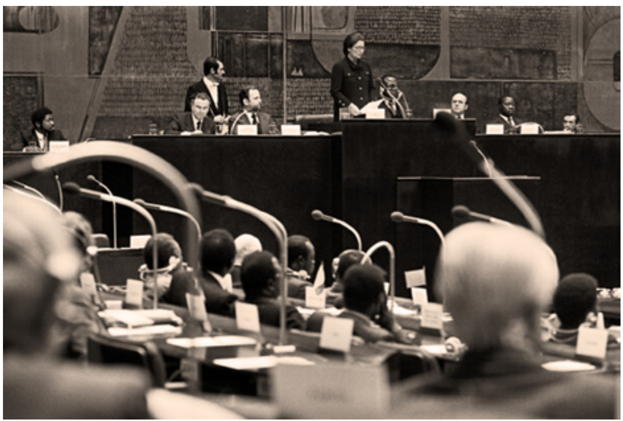
ACP-EEC Consultative Assembly: Simone Veil, President of the European Parliament, giving a speech, Luxembourg, 10 October 1979

In the last resolution on the proceedings of the parliamentary bodies of Lomé II,<sup>186</sup> Southern Africa is the central issue of the document, and three points in particular: the support given to a peaceful solution to the problems of South Africa through dialogue between the various political forces, open criticism of the rejection by the ACP-EEC Bureau of a hearing in the next session of the Consultative Assembly, which would have provided an opportunity for a direct confrontation between the parties in question, and the invitation to the Member States and Community institutions to apply sanctions against South Africa unless it presented a plan to end apartheid by the next session of the Consultative Assembly.