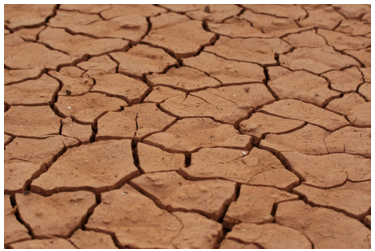
Cracked earth desert. Drought is one cause of the increasing incidence of famine in some African countries.

With regard to the products covered, the logic adopted by Parliament was once again that of helping the least developed countries, which explains the repeated call for an extension of access to non-processed agricultural products. This call was partially answered in 1977 when tropical goods were included in the list, but the European Parliament insisted on a progressive extension to products falling within the scope of the common agricultural policy.