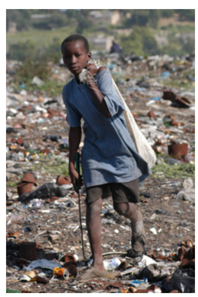
A hungry child collects rubbish from a landfill, Maputo, Mozambique. In 1989 the EP adopted a resolution calling on the Commission to provide designated aid for major projects in Mozambique.

In June 1998 South Africa acceded to the Lomé Convention and signed a bilateral agreement with the Community on trade, development and cooperation, necessitating certain changes to the existing regulations<sup>354</sup>, expiring at the