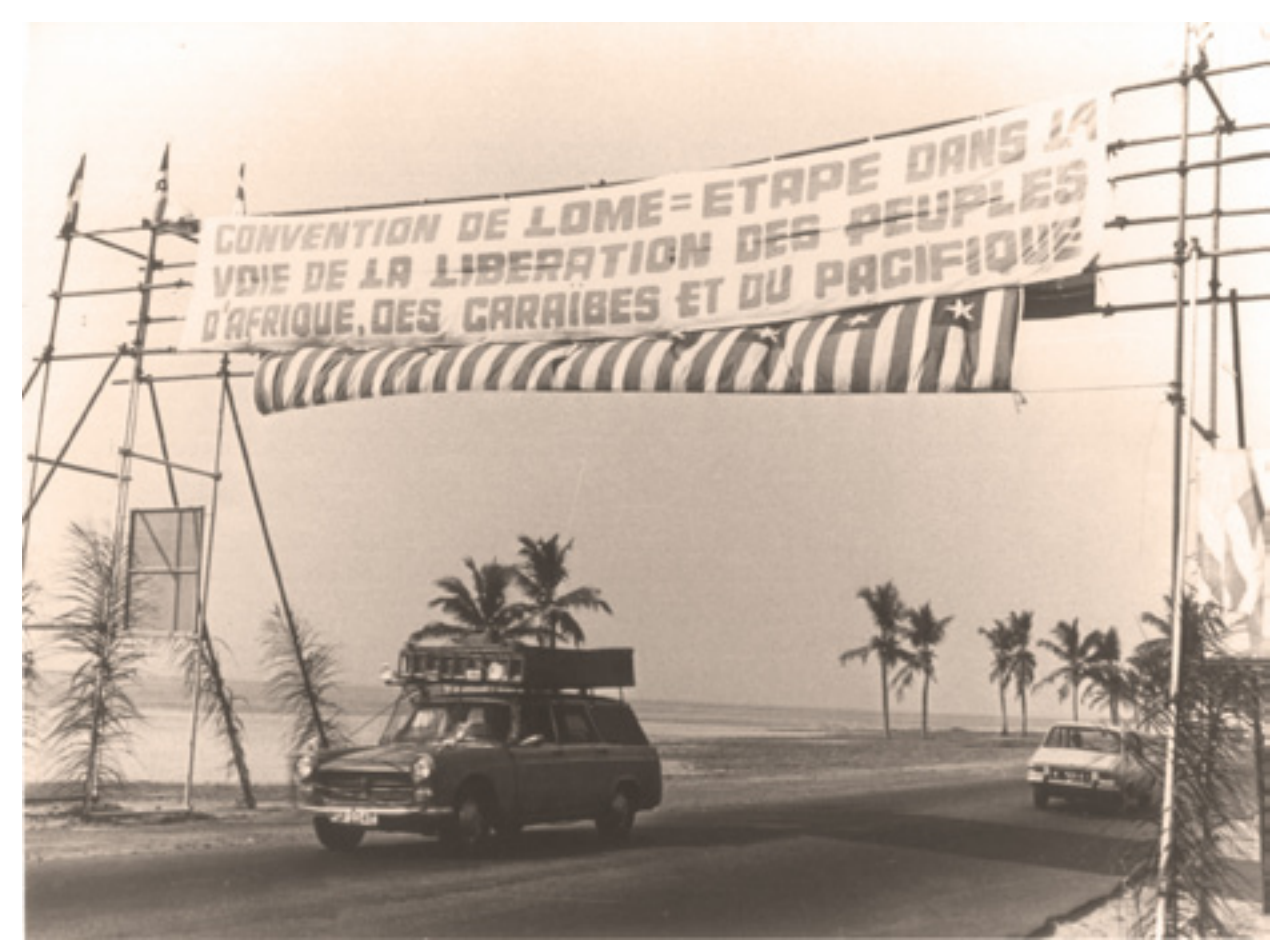
Banner inscribed 'Lomé Convention: a step along the road towards the liberation of the people of Africa, the Caribbean and the Pacific', referring to the Lomé I Convention, February 1975

The 11th Parliamentary Conference of the Yaoundé Convention naturally devoted its work to examining the negotiations, which had been suspended on 15 January, and called for them to be swiftly concluded<sup>153</sup>. The European Parliament<sup>154</sup>, when it issued its opinion, noted with satisfaction that the Conference's call had been heeded and that the negotiations had been concluded.