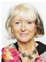
Ms Jana FISCHEROVA Vice-Chair, Committee on Foreign Affairs Civic Democratic Party - ECR