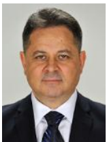
Mr Ionel AGRIGOROAEI

Chair, Committee on Defence, Public Order and National Security National Liberal Party - EPP