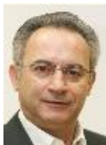
Mr Averof NEOFYTOU Chair, House Standing Committee on Foreign and European Affairs Democratic Rally Party - EPP