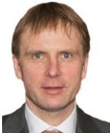
Mr Eerik-Niiles KROSS Foreign Affairs Committee Estonian Reform Party - ALDE