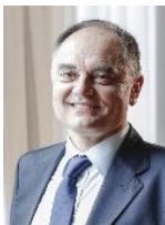
Mr Branislav RAJIĆ Vice-Chair, Committee on Foreign Policy Party of Modern Centre - ALDE