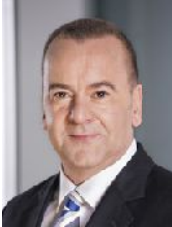
Mr Boris PISTORIUS Committee on Internal Affairs SPD - S&D