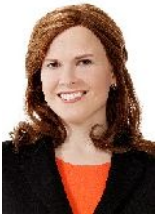
Ms Mari-Leena TALVITIE Committee on Administration National Coalition Party of Finland - EPP