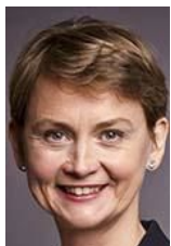
Ms Yvette COOPER Chair, Home Affairs Committee Labour - S&D