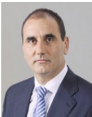
Mr Tsvetan TSVETANOV Chair, Committee on the Internal Security and Public Order PP GERB - EPP