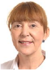
Ms Monica MACOVEI ECR