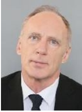
Mr Jaroslav PAŠKA Committee on European Affairs SNS - EFDD