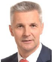
Mr Artis PABRIKS EPP