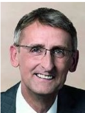
Mr Armin SCHUSTER Committee on Internal Affairs CDU - EPP