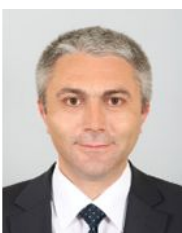
Mr Mustafa KARADAYI Committee for Control of the Security Services, the Application and Use of the Special Intelligence Means and the Data Access under the Electronic Communications Act MRF - ALDE