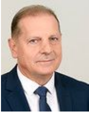
Mr Andrzej MIODUSZEWSKI

Committee on Human Rights, the Rule of Law and Petitions Law and Justice Party - ECR