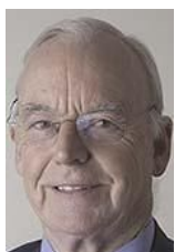
Lord Clive SOLEY EU Home Affairs Sub-Committee Labour - S&D