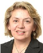
Ms Caterina CHINNICI