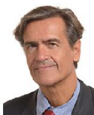
Mr Juan Fernando LÓPEZ AGUILAR S&D