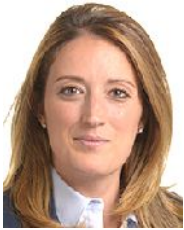
Ms Roberta METSOLA EPP