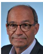
Mr Éric WOERTH

La République en Marche - No Group Affiliation in the EP