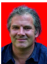
Mr Andrej HUNKO

Committee on the Affairs of the European Union DIE LINKE - GUE/NGL (European United Left - Nordic Green Left)