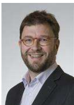
Mr Timo HARAOKA Grand Committee The Social Democratic Party of Finland - S&D (Progressive Alliance of Socialists and Democrats in the European Parliament)