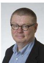
Mr Kimmo KIVELÄ Grand Committee Blue Reform - ECR (European Conservatives and Reformists)