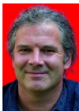
Mr Andrej HUNKO Committee on EU Affairs DIE LINKE - GUE/NGL