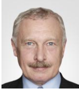
Mr Zdeněk BESTA Committee on European Affairs Czech Social Democratic Party - S&D