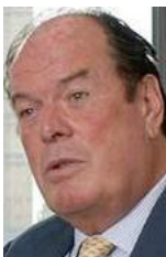
Lord John Quentin DAVIES Sub-Committee on EU Economic and Financial Affairs Labour - S&D