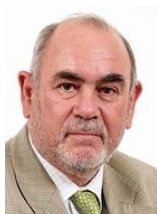
Mr Richard YUNG Committee on Finances Parti Socialiste - S&D