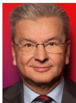
Mr Joachim POß Committee on EU Affairs SPD - S&D