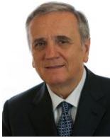
Mr Maurizio SACCONI Chair, Committee on Employment, Social Welfare AP NCD-UDC - EPP