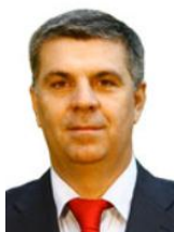
Mr Valeriu Stefan ZGONEA Speaker of the Chamber of Deputies Social Democratic Party - S&D