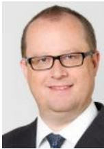
Mr Hubert FUCHS

Vice-Chair, Finance Committee Freedom Party of Austria (FPÖ) - No Group Affiliation in the EP