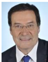
Mr Pierre-Alain MUET Vice-Chair, Committee on Finances Socialiste, républicain et citoyen - S&D