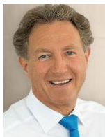
Mr Norbert BARTHLE Head of the German delegation Committee on Budget CDU/CSU - EPP