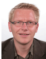
Mr Georges GILKINET Committee on Finance and Budget Ecolo - Greens/EFA