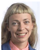
Ms Evita WILLAERT Committee on Social Affairs Ecolo - Greens/EFA