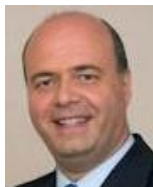
Mr Paulo MOTA PINTO Chair, Committee on European Affairs Social Democratic Party - EPP