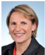
Ms Valérie RABAULT Rapporteuse générale, Commission des finances Socialiste, républicain et citoyen - S&D