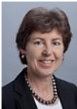
Ms Kathy RIKLIN Chair, Committee on European Union Affairs Christian Democratic People's Party of Switzerland (CVP)