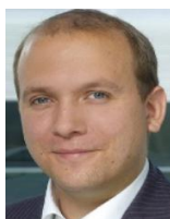
Mr Manuel SARRAZIN Committee on EU Affairs BÜNDNIS 90/GRÜNE - Greens/EFA