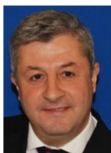
Mr Florin IORDACHE Chair, Committee on Labour and Social Protection Social Democratic Party - S&D