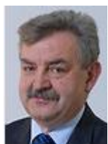
Mr Kazimierz KLEINA Chair, Committee on Budget and Public Finance Platforma Obywatelska - EPP