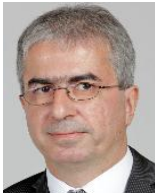
Mr Uroš PRIKL Chair, Committee on Labour, Family, Social Affairs and Disability Democratic Party of Pensioners of Slovenia - Non-Attached