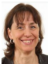
Ms Fabienne KELLER Vice-Chair, Committee on Finances UMP - EPP