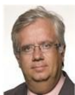
Mr Eduardo CABRITA Chair, Committee on Budget, Finance and Public Administration Socialist Party - S&D