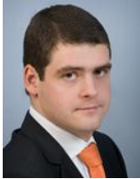
Mr Remigijus ŽEMAITAITIS Chair, Committee on Economics Order and Justice Political Group - EFDD