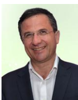
Mr Giorgios PERDIKIS Committee on Financial and Budgetary Affairs The Cyprus Green Party - Greens/EFA