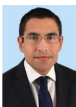
Mr Antoine BORG Spokesperson for Tourism Nationalist Party - EPP