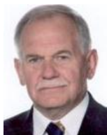
Mr Andrzej GAŁAŻEWSKI Vice-Chair, Committee on European Union Affairs Civic Platform - EPP